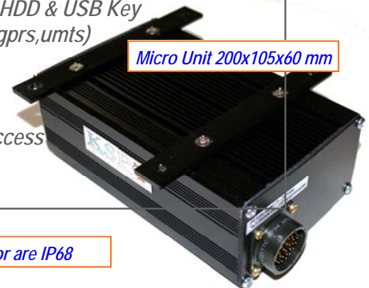
Micro Unit 200x105x60 mm

Recording Server, Windows XP or Linux based, support from 1 to 8 IP camera Drive up to 8 IP PoE Cam (include a 8 port PoE Switch embedded) Completely Solid State, without "in movement" part (or with certified automotive conventional HDD) Operative System & Storage completely on Solid State memory Image Storage from 8Gb to 256 Gb and over with Hot Plug function & Raid 1 Gb Ram, Processor C7 up to 3 Ghz Compatible with all IP Camera & Encoder (accept analog camera image input on NVR custom version) Recording & Management Software pre-installed with Export Data directly on HDD & USB Key Remote Access at Live & Recorded Image with ip connection (adsl, isdn, pstn, gprs, umts) Mounting Kit & Power Supply Automotive 9/12/24/48 Volt Interface on vehicle for automatic power switch on / off PreConfigured System, with all accessories for mounting e connection Strong Cripto of the storage on PGP & RSA algorithm, USB Key for Admin Access Connect directly to AVIM system via CAN Bus Protocol & Others on request Work in Multi NVR Environment like a black box, stand alone unit